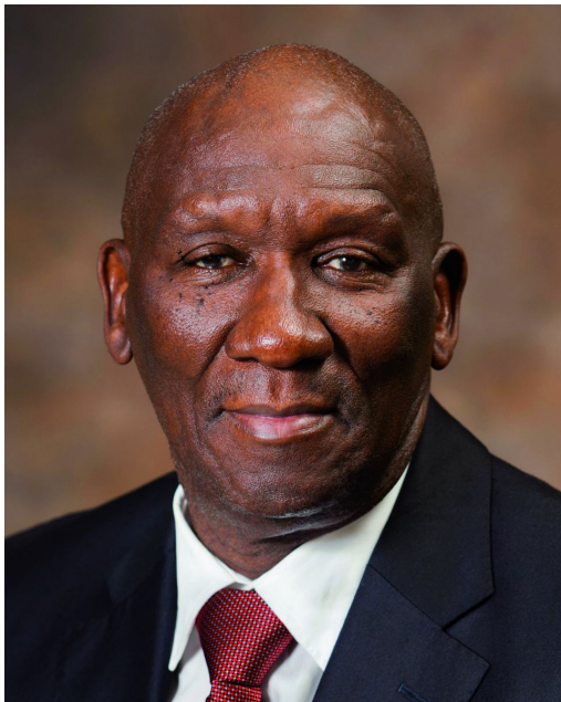
Gen. Bheki Cele (MP) Deputy Minister of Agriculture, Forestry and Fisheries

As it was indicated in the 2015/16 Annual report, DAFF has continued to support smallholder producers and new entrants. The project of transforming the agricultural, forestry and fisheries sectors has gained momentum. The Minister and I visited many communities in an effort to understand their conditions, particularly on the drought situation that was said to have been one of worst the country has experienced in in many years.