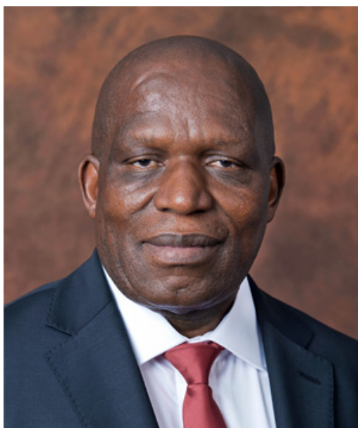
Mr Senzeni Zokwana (MP) Minister of Agriculture, Forestry and Fisheries

I am honoured to present the 2016/17 Annual report of the Department of Agriculture, Forestry and Fisheries (DAFF). This annual report is a key instrument for the department to report against its set performance targets and budget outlined in the department's Strategic Plan.